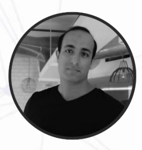
Certified Supply Chain Professional from APICS, USA, MBA in Supply Chain Management Bachelors in Commerce